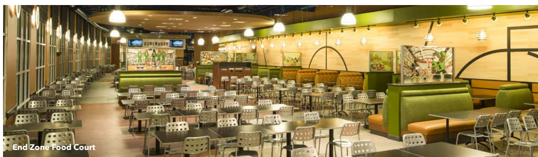
End Zone Food Court