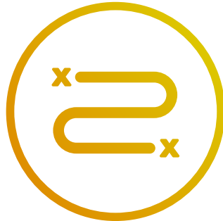
JOGGING/WALKING (3.1 MILE PATHWAY)