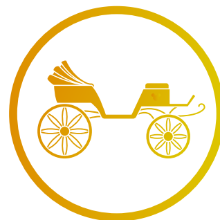
HORSE DRAWN CARRIAGE, WAGON, & PONY RIDES