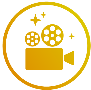
MOVIES UNDER THE STARS