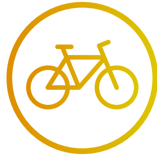
BIKE, CANOE, & KAYAK RENTALS